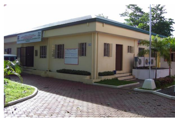
The Pampanga River Flood Forecasting and Warning Center located in the Government Center, Bgy. Maimpis, San Fernando, Pampanga. (top left – view of the compound area, top right – the operations building)